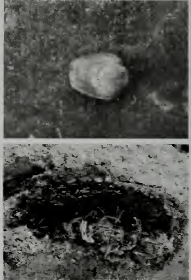
Figure 5. (top) cleaned J. arizonica seed taken from nest. (bottom) Fungal farm in ant nest.

In our situation the ants generally become active in the morning, forming only a single marching column about eight inches wide to the juniper tree. They harvested the berries from the ground only, and returned at a rate of one berry every two minutes. This continued all day (~8 hr) for a week. At such a rate as many as 1600 berries may have been carried to their nest. During this period, the column from the juniper tree to the nest carried only juniper seeds. A few ants, not in this column, cut up leaves from a Penstemon near the hole. On another occasion, an ant column was harvesting only bird seed in a bird feeding area. When juniper berries were placed along the 'bird seed' column, the ants refused to pick up any berries. It appears that the ants just harvest one kind of material at a time.